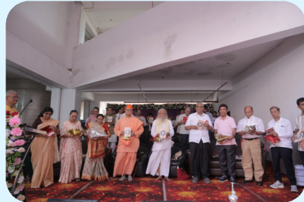
Book on community Based Rehabilitation released during inauguration function