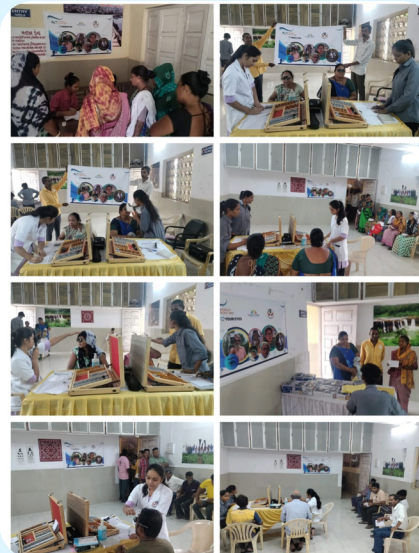
World Sight Day celebration