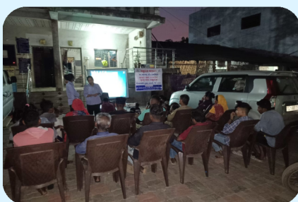
Eye donation awareness session at night in village