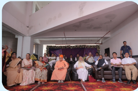
Guests on the dias during inauguration function