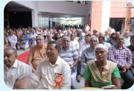
Audience during inauguration function