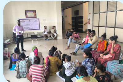
ROP awareness generation session