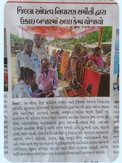
Ukai camp pressnote