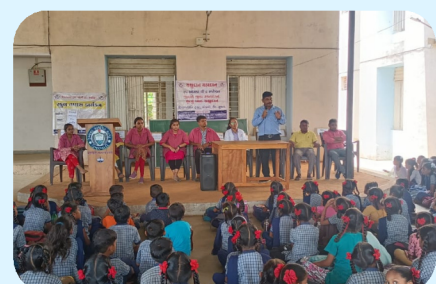
Eye donation awareness talks among school going children