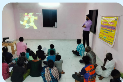
Eye donation awareness session